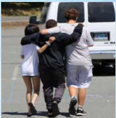
Sometimes a picture just says it all.