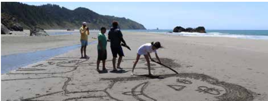
(Flip page over)