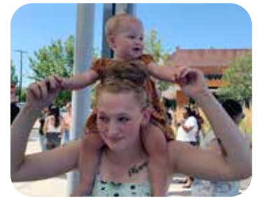
HWAM youth, alum, staff and their families enjoying a day of fun together