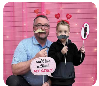
A couple of volunteers rocked the photo booth

Make sure to keep your eyes peeled for details about our 2026 Galentine's event. We're already looking forward to it!