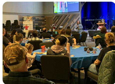
The Faith Forum introduced Safe Families in Coos County